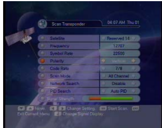
STEP 8 Go down to Polarity and change it to "Vertical"