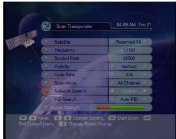
STEP 10 Go down to Network Search and change it to Enable and Scan using the remote control