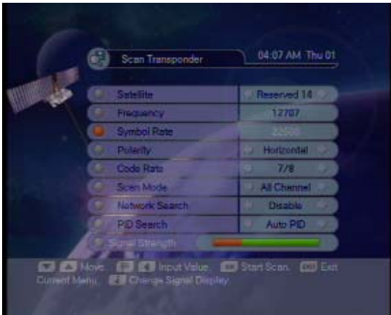
STEP 7 In the Symbol Rate enter 2 2 5 0 0