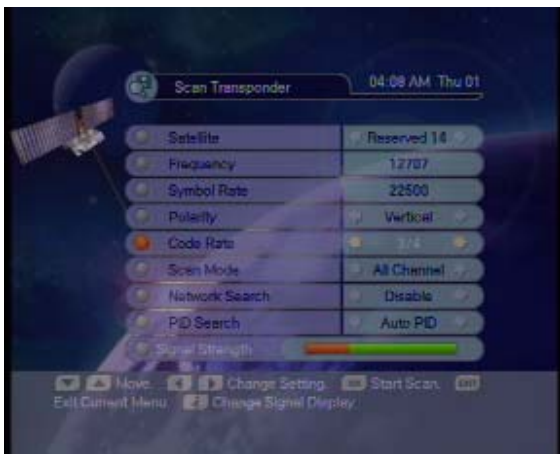
STEP 9 Go down to Code rate and change it to 3 /4 by using left or right arrow key